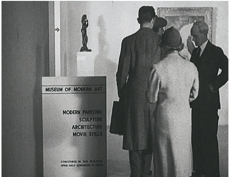
9-10 Sequential film stills from "Negro Artist Hailed," Pathé News , vol. 9, no. 31, November 1937.