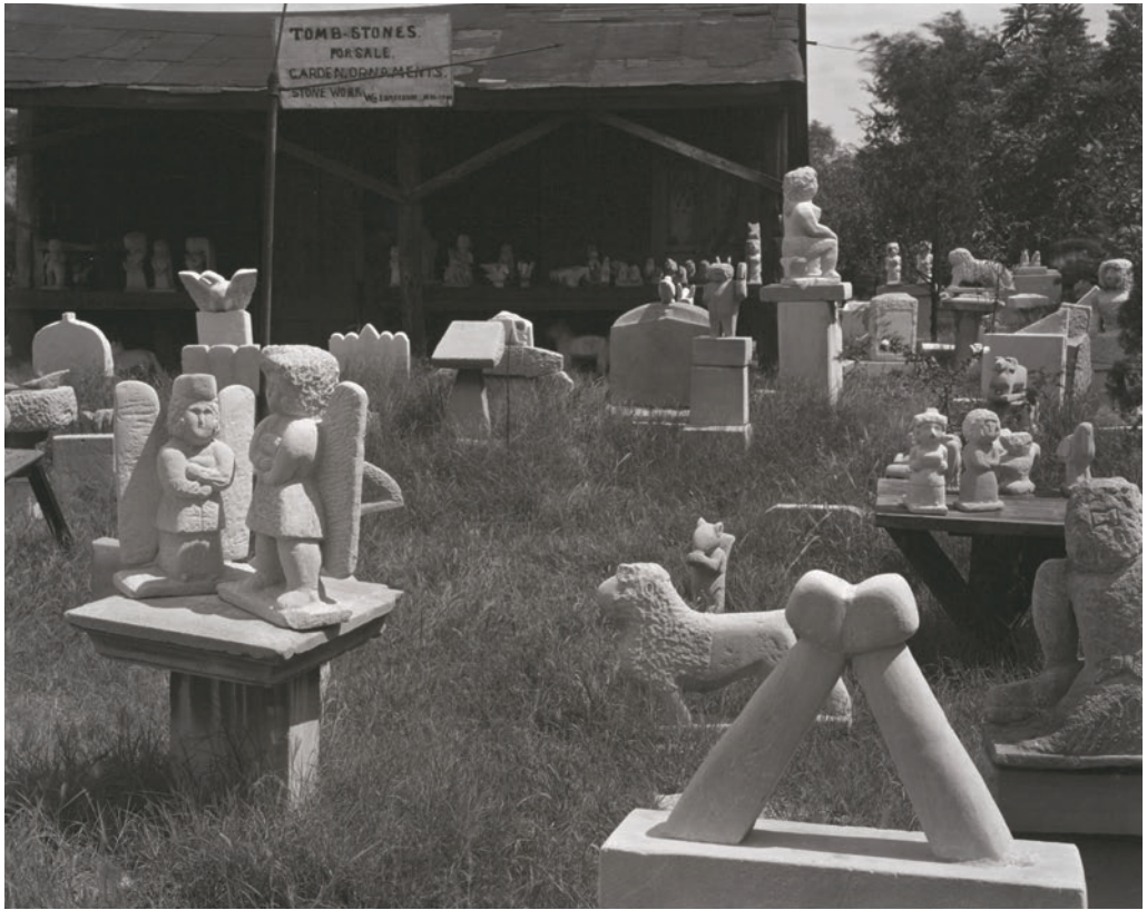
5 Edward Weston, Stone Sculpture , William Edmondson, 1941. Gelatin silver print, 7½ × 9½ in. (19.1 × 24.2 cm). The Center for Creative Photography, Tucson, Arizona. Edward Weston Archive, 81.110.104.

practice, for an audience, and as a means of sensuous communication: between God and man, the animal world and the human world, stone and art.