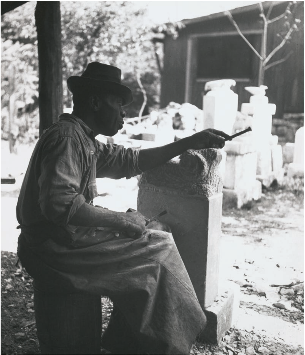
7 Louise Dahl-Wolfe, William Edmondson , 1937. Gelatin silver print, 8¾ × 7⅝ in. (22.2 × 19.4 cm). The Center for Creative Photography, Tucson, Arizona. Louise Dahl-Wolfe Archive, 93.72.71.