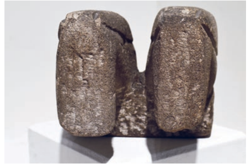
2–3 Details of Edmondson, Untitled (Two Doves) (see fig. 1).